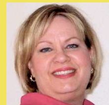
My high school English teacher